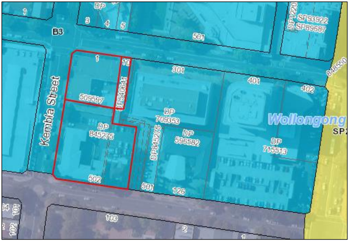
Figure 2 – Zoning Extract Wollongong LEP 2009